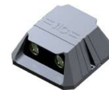
TL-LH5407 WALKWAY LIGHT