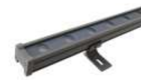
TL-LH1010 LED WALL WASHER