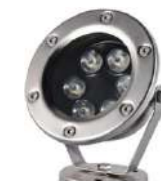
TL-LH6201 LED UNDERWATER LIGHT