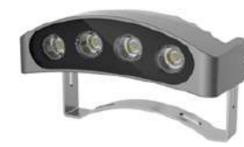
TL-LH5101 LED CORRUGATED LIGHT