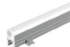
TL-LH2301 LED LINEAR LIGHT