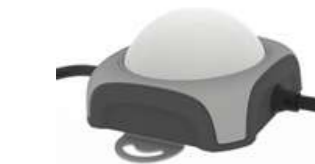
TL-LH4101 LED POINT LIGHT SOURCE