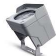
TL-LH3101 LED FLOOD LIGHT