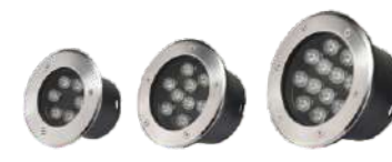
TL-LH6115 LED UNDERGROUND LIGHT